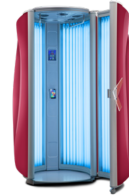
Fancy Red Metallic